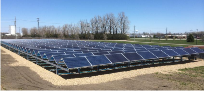
Steele-Waseca Cooperative Electric's 100 kW Sunna Community Solar Garden Owatonna, MN