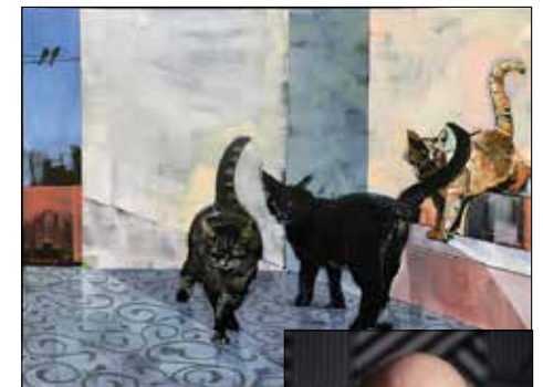
(top): "Birds on a Wire," by painter David Mataya

Acknowledging the recent advancement of im-